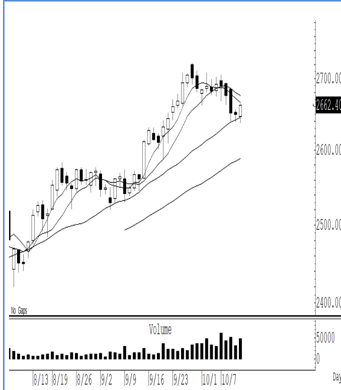
GOZ24 (Close 2,645.00 Chg -6.70)

ราคาทองคำโลกปรับตัวต่ำกว่าคาดเล็กน้อย แต่ก็ตั้งลำแถว ๆ 1,640 ดอลลาร์ ฟันตัวกลับขึ้นมาได้อีกครั้ง เราแนะนำยกการ์ดสูงหรือตั้ง stop ไว้ จากความผันผวนของราคาที่เราคาดว่าจะแกว่งแรง แนะนำ trading ในกรอบ 2,650-2,685 ดอลลาร์ ระวังกำไร ปิดต่ำกว่าระดับ 2,640 ดอลลาร์ แนะนำถือ short เพื่อหวังผลปรับตัวลงแถว ๆ 2,600 ดอลลาร์ ระวังกำไร เรากำหนดจุด stop สำหรับข้าง long ไว้ที่ 2,635 ดอลลาร์